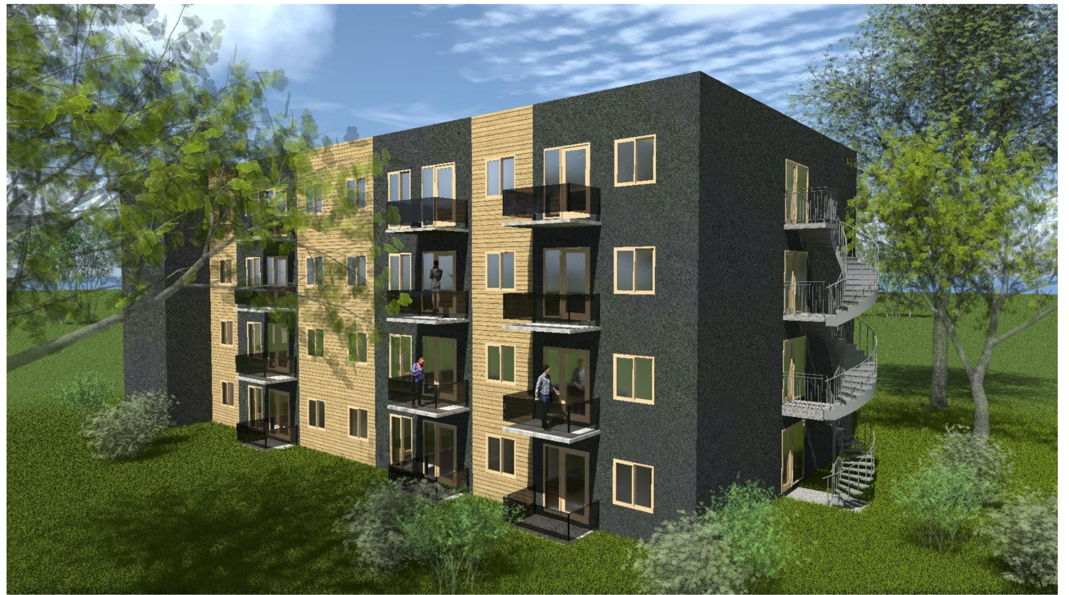
Example of building facades, could be updated to every project separately.